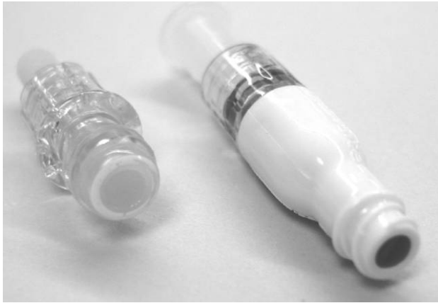
Figure 2. The 2 vascular catheter connector valves described in this study. The valve on the left is the split-septum valve used before and after the outbreak of primary bloodstream infection. The valve on the right is the luer-activated, positive-displacement connector valve that was temporally associated with an increase in the rate of bloodstream infection.

This study also demonstrated the complexities of health care system supply lines. A multitude of persons and viewpoints are involved in decisions regarding supply purchases; potential infection control concerns are only one, albeit a very important, consideration. In heavily bureaucratized and outsourced hospital supply systems, decisions regarding device distribution are not easily communicated throughout. In addition, end users of supplies may have personal stockpiles of supplies that are not officially sanctioned. We encountered obstacles at various levels of the supply chain in attempting to remove the connector valve from clinical use. Although efforts to remove the new connector valve and replace it with the original valve were initiated in June, we continued to find the putative offending device in sporadic clinical use throughout the summer. This may explain why bloodstream infection rates did not decrease as steeply when the device was removed as they had increased when the device was introduced. Only through repeated, thorough searches of supply rooms, bedside cabinets, and nursing units and repeated communication along the supply line did we finally achieve a complete exchange of devices by September.